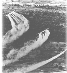
Operation Ranch Hand aircraft spraying, South Vietnam.

The key to receiving maximum benefits for your AO claim is to make sure that VA has assigned the correct "effective date" to your claim. This date appears under the heading "What We Decided" in the letter that contained the decision on your claim. Usually, the earlier the "effective date," the higher the benefit.